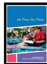
My Time, Our Place; Framework for School Age Care in Australia 2022 V2

Critical reflection: is a meaning-making process that assists informing future practice in ways that demonstrate an understanding of each child’s learning, development and wellbeing and implications for equity and social justice. It involves examining and analysing events, experiences and practices from a range of perspectives to inform future planning and decision-making ( Early Years Learning Framework 2022 V2 – refer to Sources ).